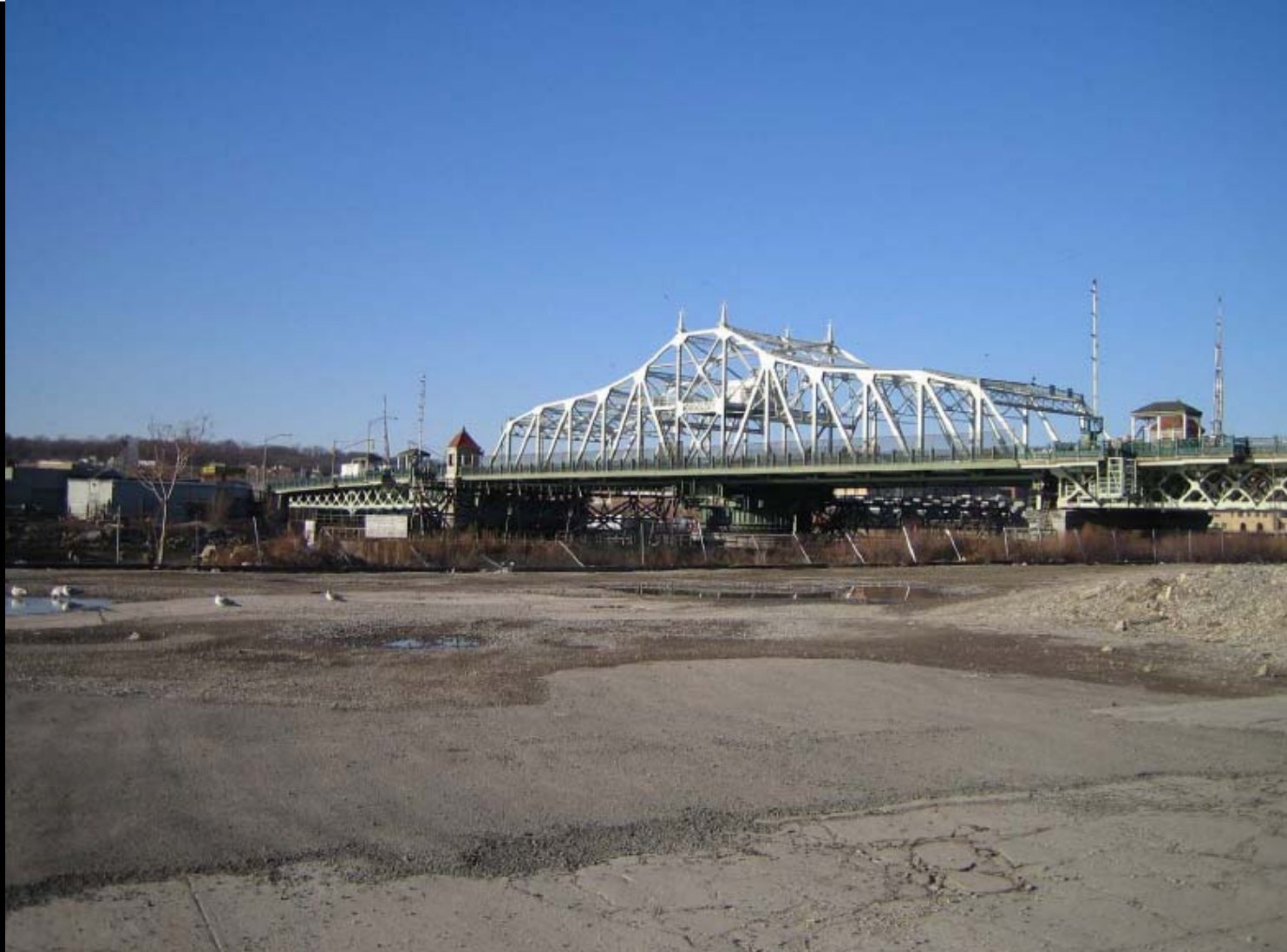
Fordham Landing – largest parcel (3 acres), at one of few access points

Encourage amenities that will draw a critical mass of people from the upland to the neighborhood.