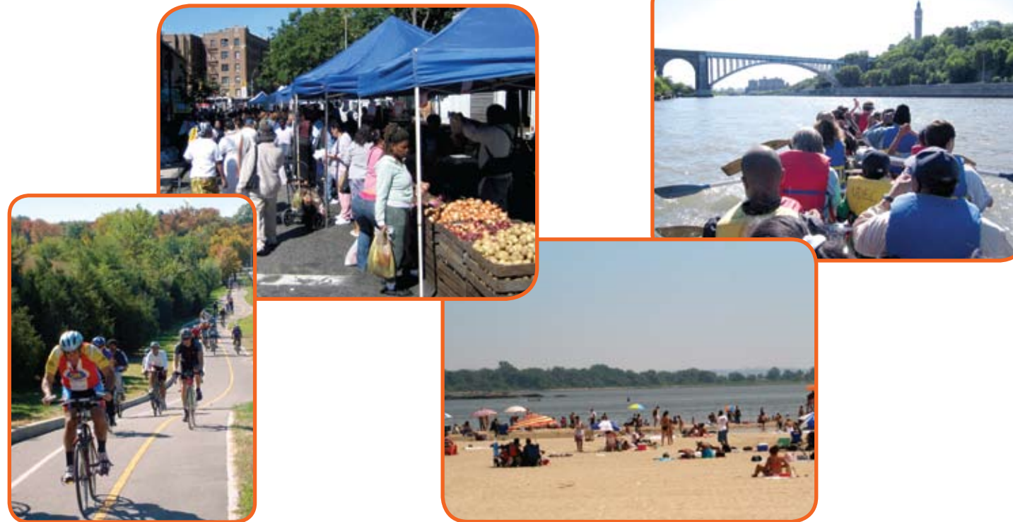
Clockwise from top left: Farmers Market at Poe Park; Canoeing on the Harlem River; Enjoying the sun at Orchard Beach; Tour de Bronx on Pelham Parkway.

For over 35 years, BCEQ has been writing and publishing the Environmental Focus newsletter, also available at www.bceq.org . BCEQ maintains a calendar of Bronx events on its web page, and annually publishes the Bronx environment photo calendar.