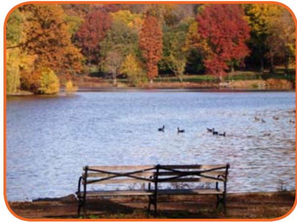
Fall at the Van Cortlandt Lake

BCEQ's annual membership meetings focus on water and other environmental issues in the Bronx.