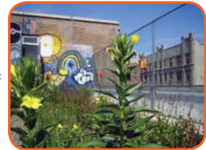
Greenroof at St. Simon Stock School