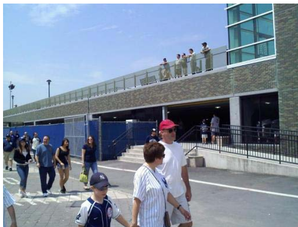
These photos were taken on the weekend, when there was a scheduled Yankee Game.