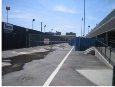
Access to Metro North looks like this on non-game day