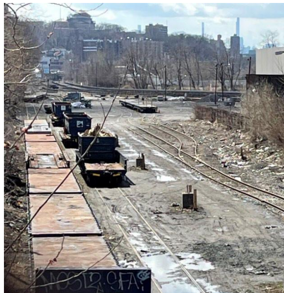
Looking North from 225 th Street at the abandoned commuter rail, I-87 and Bailey Avenue, Bronx County